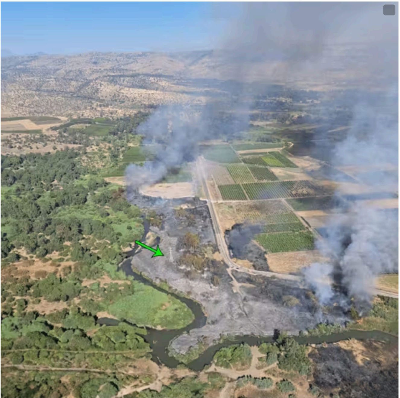
Firefighter plane photo of the burned area. Arrow marks power tower #5

The raw data shown above is fed into machine learning algorithms and AI models that can pick up different anomalies, such as strong and fast heat change, which is typical of a wildfire, and send an alert to a control center with tower locations to help direct transmission operators to the right place, saving time and in the case of a wildfire probably more than that. Other anomalies can be tracked such as, for example, short circuits, which were also detected on tower #5, most likely because of bad insulation due to soot and heavy ash particles in the air.