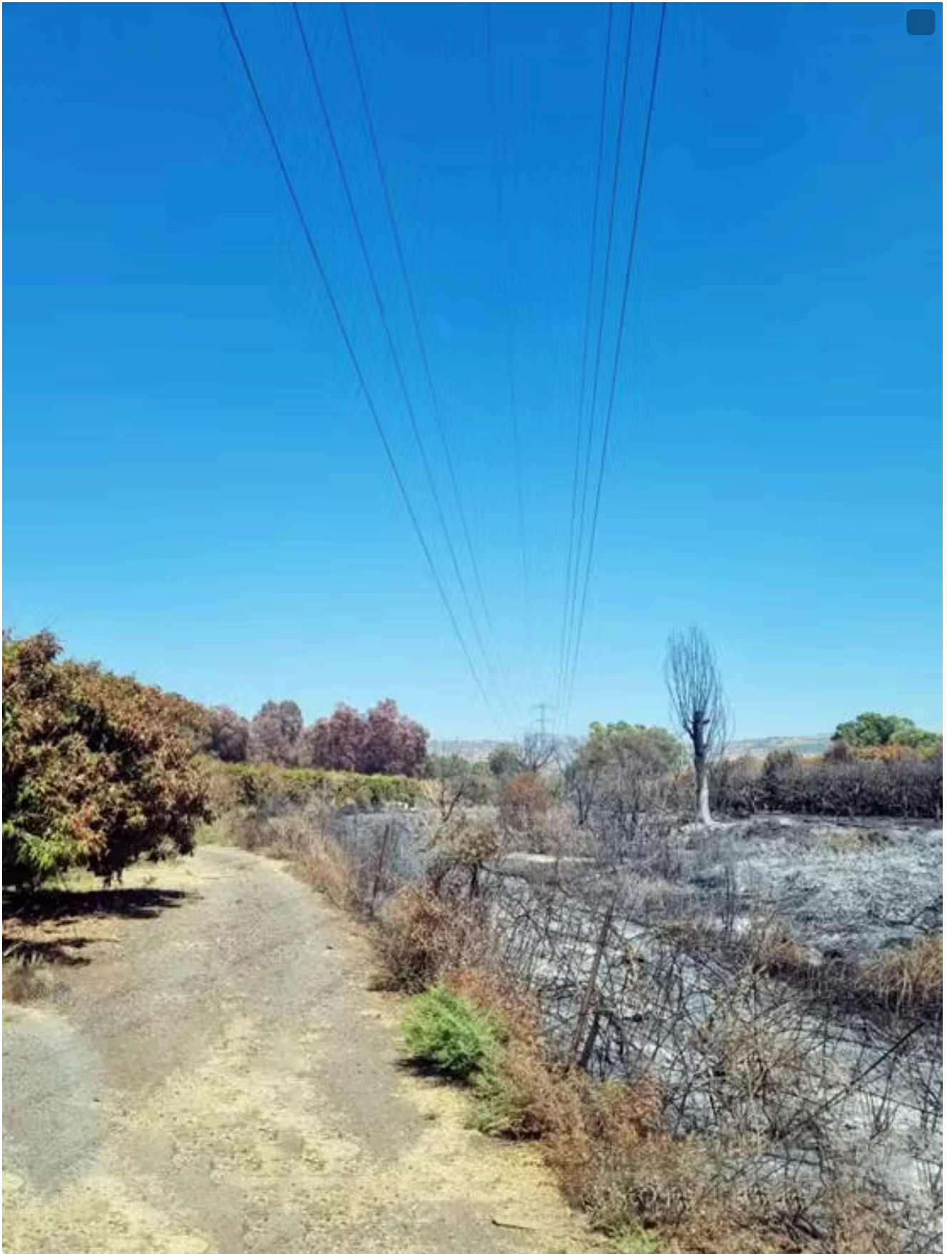
Charred land under the transmission lines